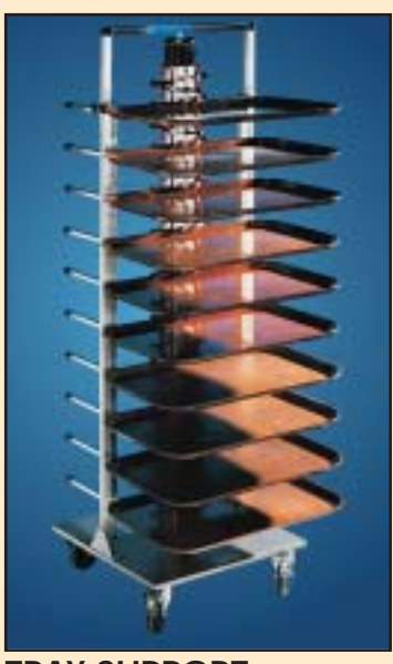
TRAY SUPPORT DBS910