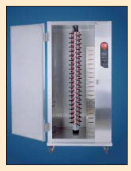
HOT MATE HM84W HM84W31