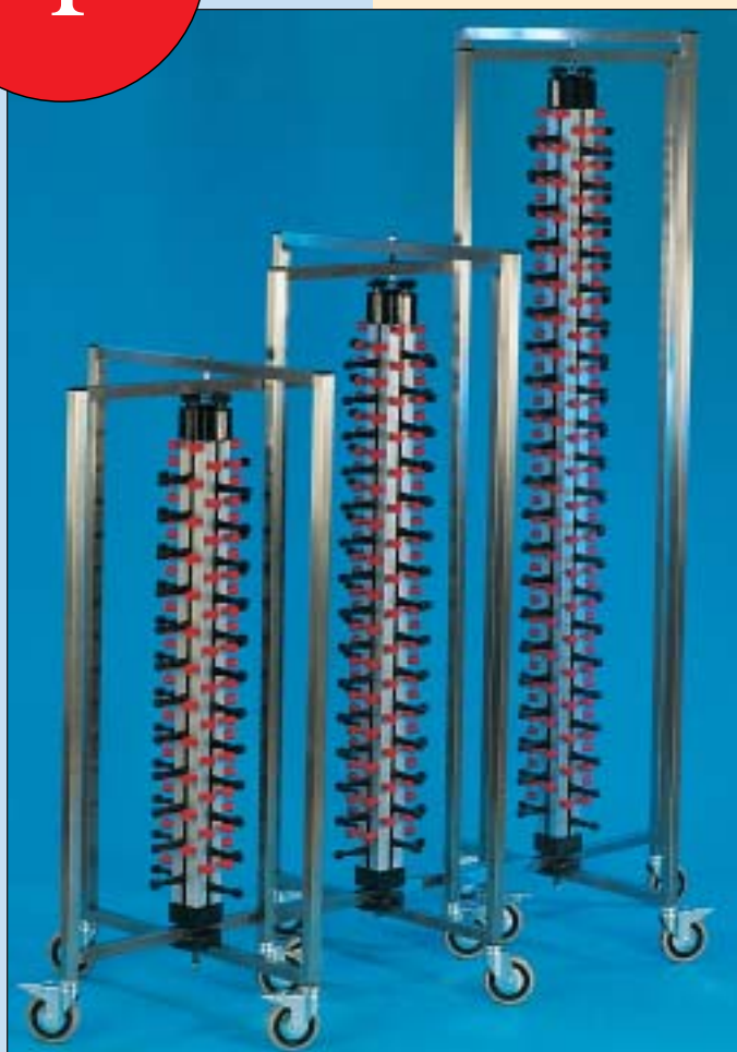
PLATE MATE has 3 types of collapsible column carts;